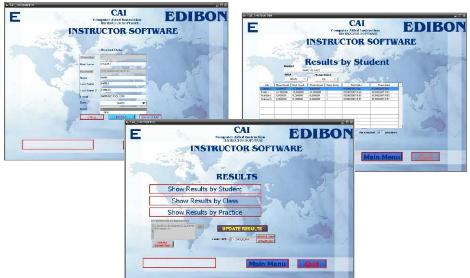
Examples of the Software screens

A.../SOF Computer Aided Instruction Software Packages (Student/Application Software).